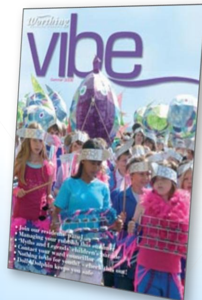
Above: An issue of Worthing Borough Council's local residents' magazine